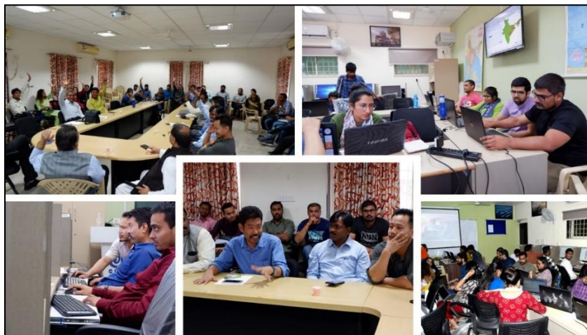
One Week “GIS and National Security” Workshop | March 2020

In March 2020, the School organized a One-week Training Workshop on “GIS and National Security” for Research Scholars and Faculty members. The Syllabi of MA in Defence and Strategic Studies as well as the M.Phil. and Ph.D. Research Programs will incorporate training in GIS tools and techniques as part of the curriculum.