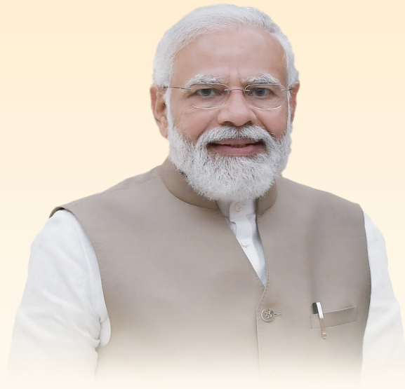
Hon'ble Prime Minister Shri Narendra Modi